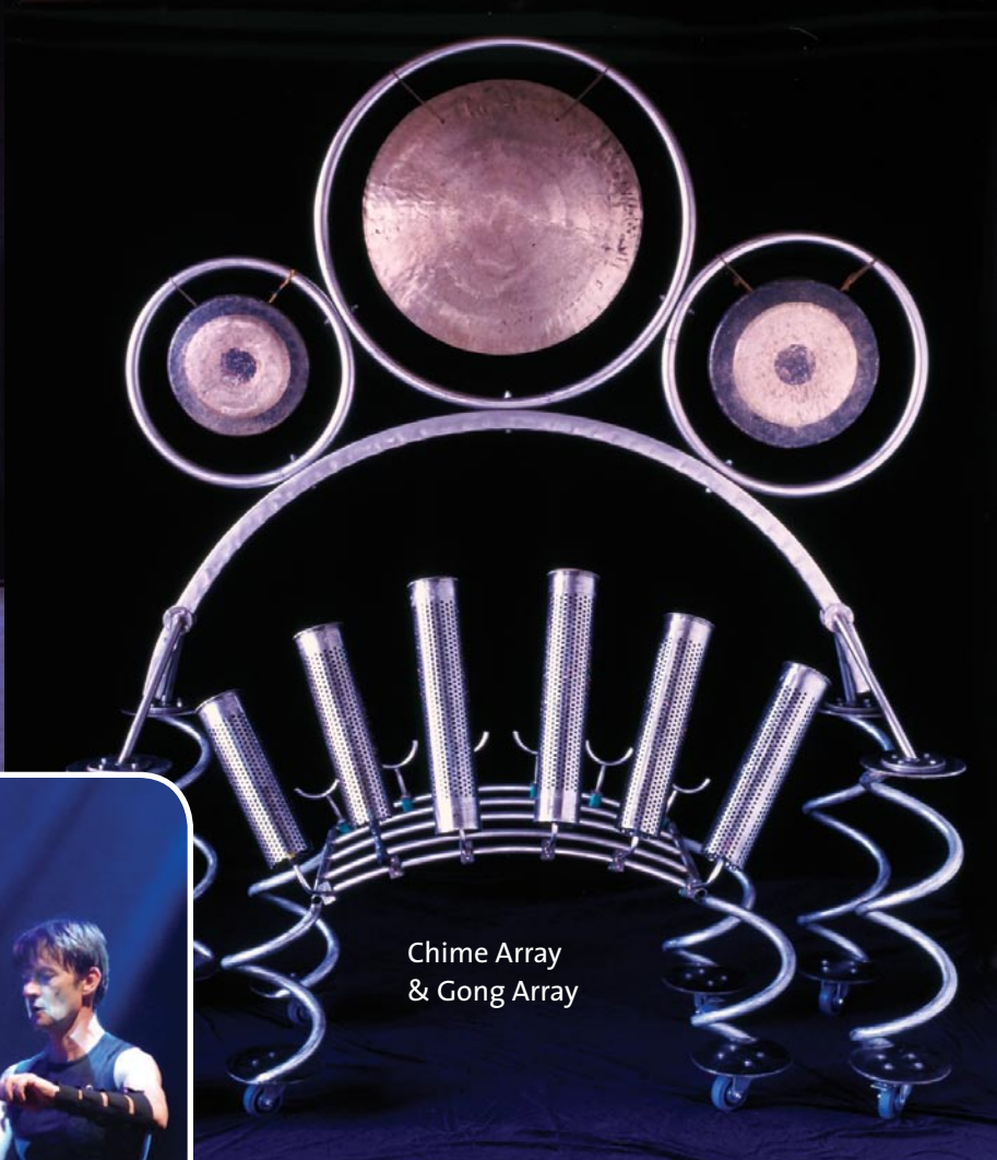
Chime Array & Gong Array