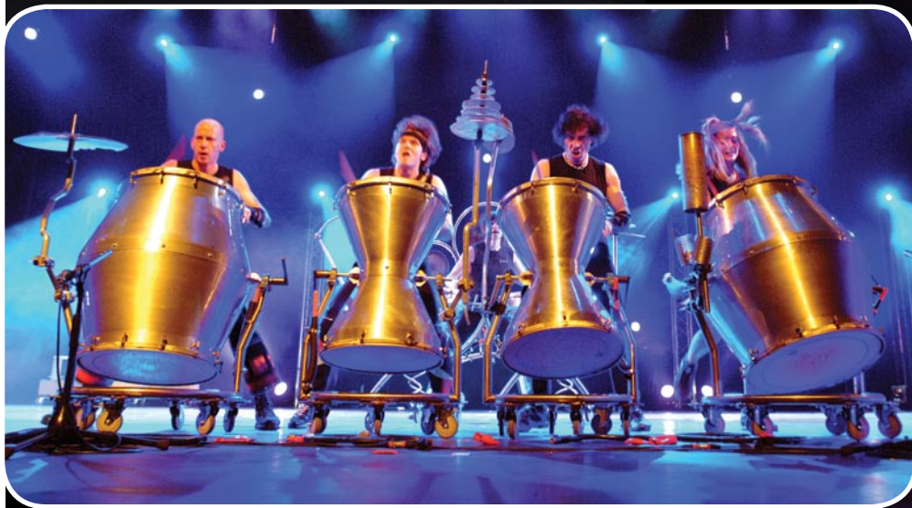
ScrapArtsMusic Artists on Humunga & Hourglass Drums