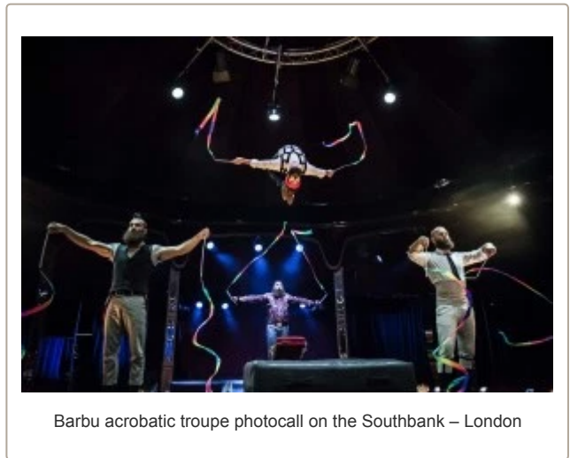
Barbu acrobatic troupe photocall on the Southbank – London

Although there are more 'traditional' circus bits – human towers four people tall, an impressive performance on the aerial hoop, a 'mentalist' section, and a classic locked box trick – this is far from a 'traditional' circus performance. Even these did not conform to expectation; the 'mentalist' projected a ridiculously camp vision into his subject's head, and the lady emerging from the locked box came out not in costume but in beard and nipple pasties. Gender is clearly a fluid concept here, and it's the source of all hilarity.